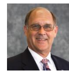
Conder Ward 4