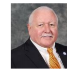
Adams Ward 7