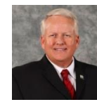
Mac Arthur Ward 5