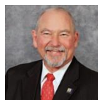
Gardner Ward 1