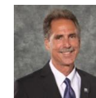
Perry Ward 6