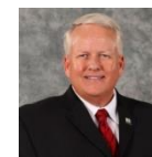
Mac Arthur Ward 5