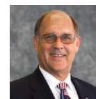
Conder Ward 4